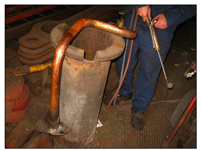
P27 - Another view of the riser pipe being set up for annealing. Big bore copper pipe bending and fitting an inevitable task in steam locomotive restoration, even when transferring parts and pipes between supposedly identical locomotives or from stock.