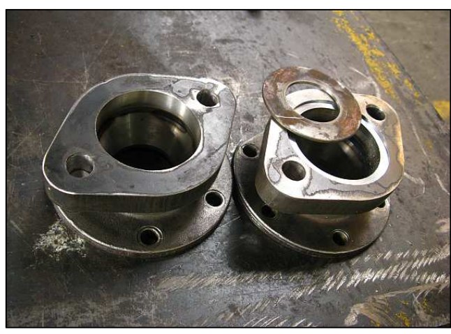
P16 - The flange on the right had a rebate carefully cut into the bore to accept the collar washer. The left flange (for the copper pipe of the water riser) did not need any modification. The flanges are quite chunky but will be less prone to distortion as the originals can be.