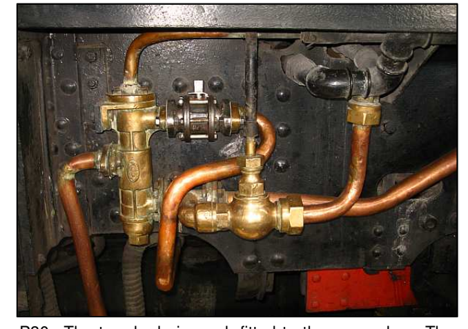
P30 - The tweaked pipework fitted to the new valve. The steel valve doesn't look pretty amongst the antique copper and bronze — but utility and reliability overrides aesthetic considerations. Best of it is that we can easily revert to the old valves if this doesn't work out as planned.

File Name: DPT UPT - 2014-M05-29 - RPT-92 ISU-143.Docx