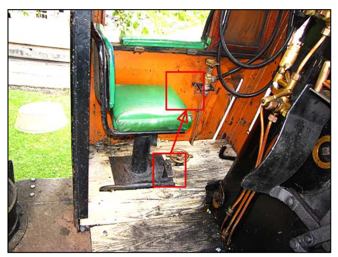
P03 - The 12AR's injector kick levers (for the injector water supplies) are being relocated to the cab walls for easier hand operation. If the 12AR's modifications prove to be successful, the 15F 3046 and 15CA 2056 will undergo the same treatment in their turn.