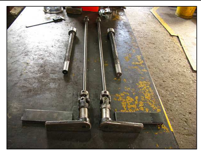
P08 - To move the kick lever from the floor to the wall required an extra shaft to be made with a universal joint at each end. The short shafts shown are similar to the originals which pass loosely through the cab floor to couple onto the valve stem via a noggin and socket arrangement.