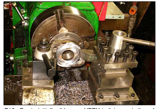
P18 - Dawie initially did some VERY judicious grinding of the new welds with a small angle grinder. Then James cut down the new gasket surface on the TBS lathe.

File Name: DPT UPT - 2014-M05-29 - RPT-92 ISU-143.Docx