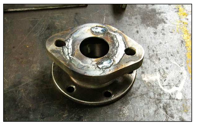
P17 - The same flange after welding. The mismatch on the RHS means that we mainly lose the advantage of the wider-bore water valve, but we will still utilize the positive action and better sealing. But even if we didn't match up the gasket face, the mismatch still would have been there.