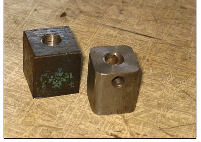
P06 - New shank blocks were machined to help eliminate excess play from the system. Unlike with the originals, the valve kick lever will only be allowed to operate through a 90 degree arc, so the system must not have any free play.

File Name: DPT UPT - 2014-M05-29 - RPT-92 ISU-143.Docx