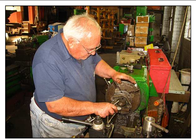
P15 - We could just assembled the set, but the RHS inlet would have been prone to gasket failure due to insufficient mating surface for the gaskets – even under the passive pressure from the head of water in the tender. James machined a groove to fit a repurposed collar washer.