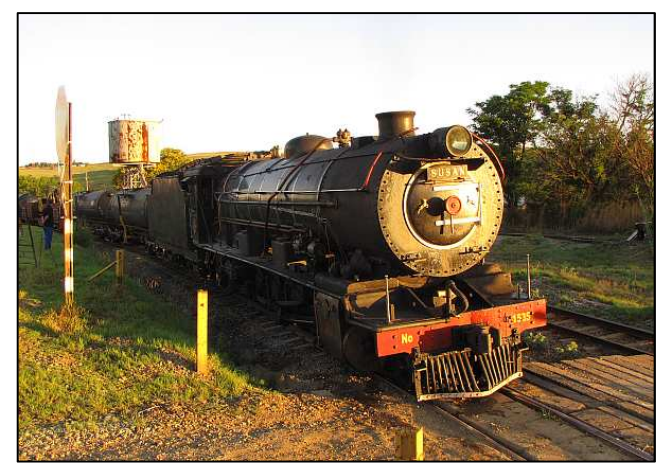
P01 - While the Class 12AR is off the high irons for repairs to the leading axle of the front bogie, the opportunity afforded by the enforced downtime was taken to upgrade the persistently troublesome water valves for the injectors.