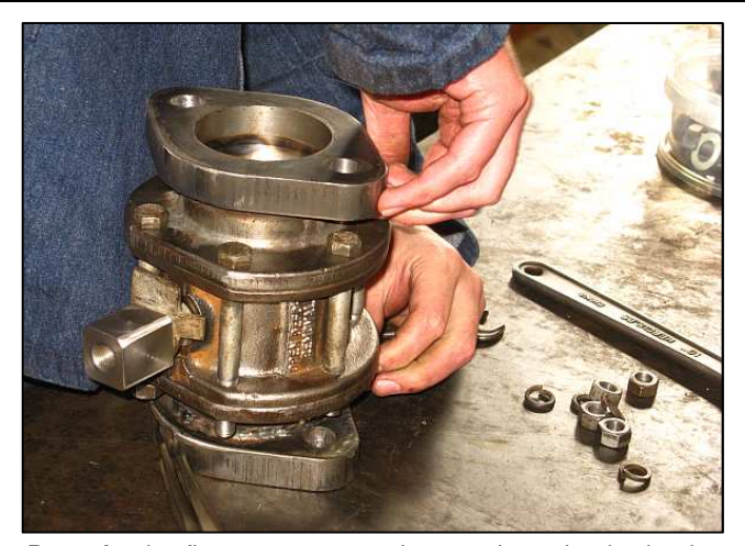
P19 - As the flanges are very close to the valve body, the clamping bolts all needed to be cut down and their threads manicured. This photo shows the new square-shanked noggin and the existing valve stop plate. The old SAR valves could rotate through 360 degrees but would only seal properly in one orientation. To add to the confusion, the original kick lever shafts can be pulled upwards to disengage them and refitted in any one of four orientations.