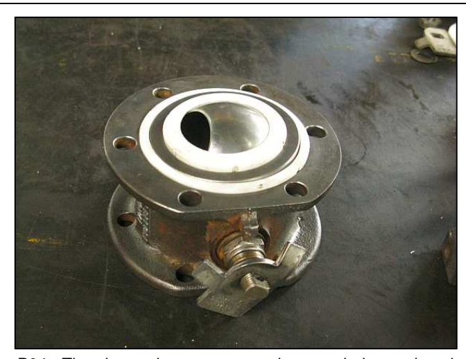
P04 - The vintage bronze water valves are being replaced with PFTE-seated stainless steel ball valves. The leaky originals waste the tender's water, but also dangerously distract the fireman as he has to look down and kick the loose-linked lever back-n-forth to find the elusive 'off' spot.