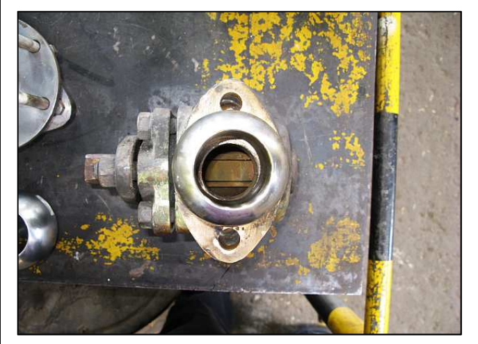
P05 - The bore in the new ball valve is 6mm wider in diameter than the original valve bore.