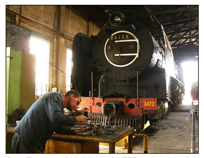
P21 - This was a fiddly job with SIXTEEN bolts all needing to be precisely cut down and their threads cleaned up.