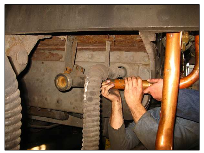
P25 - Here is the other end that needed to match up with two bolt holes to be engaged. This is where the flexible water hose from the tender is attached to the locomotive. The ribbed rubber pipe is the train brake vacuum pipe.