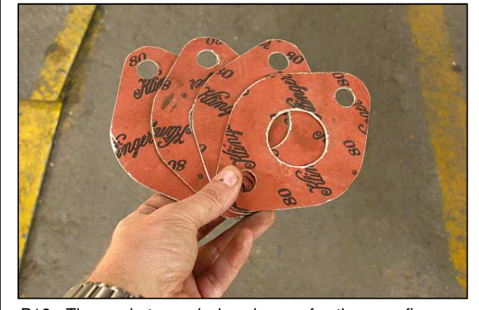
P12 - The gaskets made in advance for the new flanges. This is Klingerite. As the new valves use stem seals, they do not need a bolted-upper cover as the originals do. Those old top gaskets are frequent sources of failure if not fitted 100% correctly or the injector allowed to blow steam.

File Name: DPT UPT - 2014-M05-29 - RPT-92 ISU-143.Docx