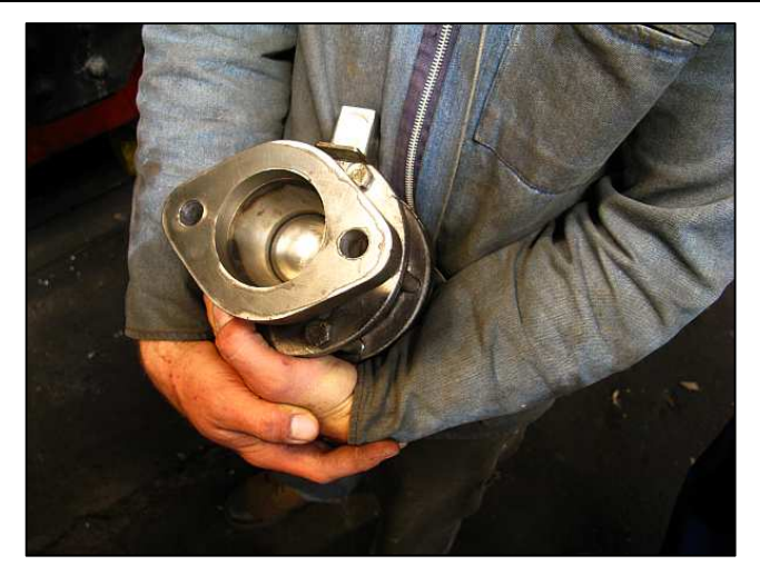
P13 - Here is a view of the assembled ball valve about to be installed for a trial fit. It was already known that the valve would be about 25mm longer than the existing and the pipework would need to be modified slightly. But our young steam-nutz were just about to get a nasty surprise!