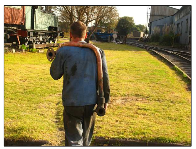
P26 - The need to keep the flanges and bolt holes parallel and to extend the swan neck meant many trips to the 'annealing shop' in the Millsite Store. The lovely Jeandrette demonstrates the fashionable copper pipe boa.