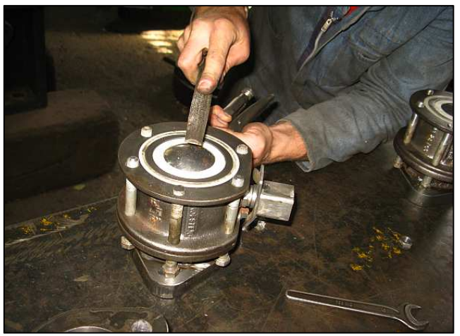
P20 - The bolts were being incrementally ground-down with a mini grinder rather than being sawed off. If you look closely at the photo, the pairs of bolts to the left and right had already been chamfered and cleaned. The remaining two bolts had to be cut down quite precisely as their axis conflicted with that on the main flange bolts. (Unavoidable because of the valve/flange orientation.) Enough thread had to be left to allow the nuts to tighten up properly.