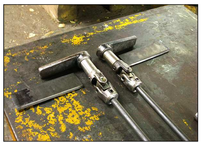
P09 - Detail of the kick levers mounted onto new stubby shafts, each running within a machined sleeve. The sleeves will be welded to the two bars which will protrude from the cab wall and will also support the quadrant stops. The tubular sleeves will also have grease nipples fitted.