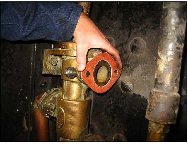
P14 - Oops! The flange measurements were taken from the flange of the copper riser pipe and one would naturally assume that the holes are the same. (They DO match on the fireman's side) The bore of the injector's water inlet is significantly smaller even though the flange bolts match up.