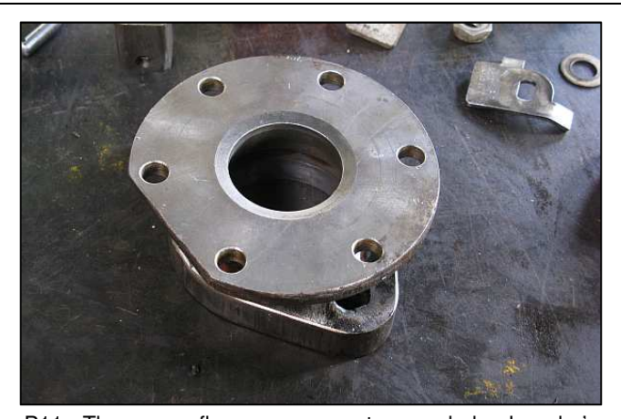
P11 - These new flanges were custom-made by Jeandre's dad. They are very close-coupled to the valve body flange, to keep the length of the new valve assembly to be kept to a minimum. The whole new assembly was able to fit in a length only 25mm longer than the original cast-body valve.