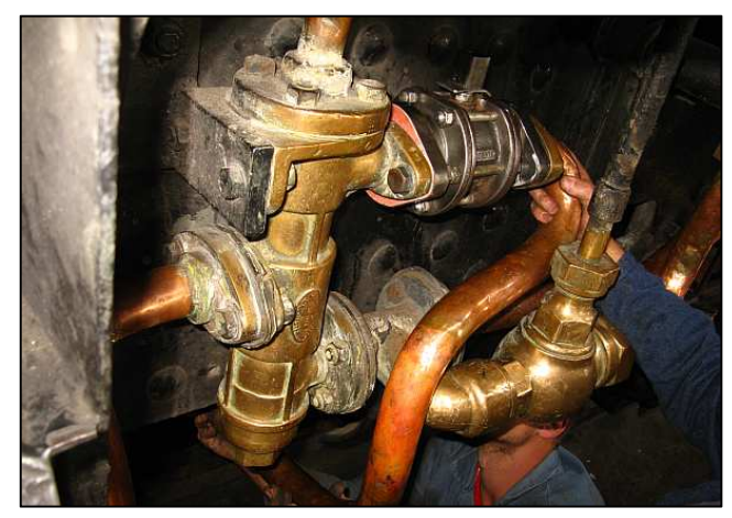
P24 - Now THIS stage of the job was the most awkward and swearword-inducing. Not only did the pipe flange need to fit, but also the intake elbow at the bottom, with the pipe making a longer swan neck around the drench valve.

File Name: DPT UPT - 2014-M05-29 - RPT-92 ISU-143.Docx