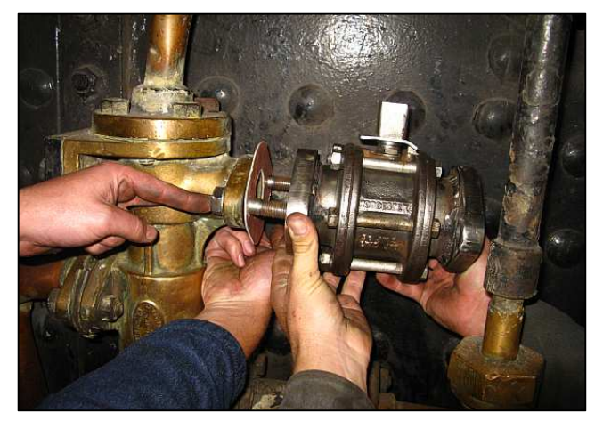
P23 - Test fitting the valve. They knew the adapted flange would match, but the bolt being pressed inwards was still unknown. It turned out too long and had to be trimmed even move. Which pair of hands belong to which grunt?