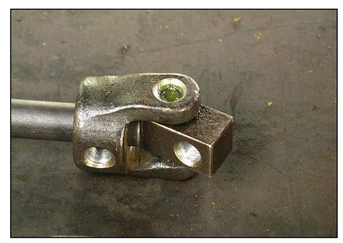
P10 - A close up of a universal joint being overhauled. These joints are being repurposed from old turret valve spindles, which usually only have one universal joint each. The yokes and die blocks are being drilled-out and pinned together with spring steel pins to eliminate all free play.