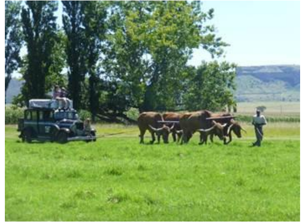
While on the farm the Graham Paige tried a bit of off-roading but had to be rescued by our span of Afrikaner Oxen.

From: THREE AMERICAS [ mailto:three_americas@yahoo.com ]