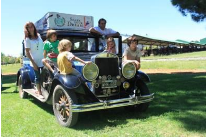
The Zapp family

A wonderful family from Argentina stopped by and they were certainly excited as you can see below.