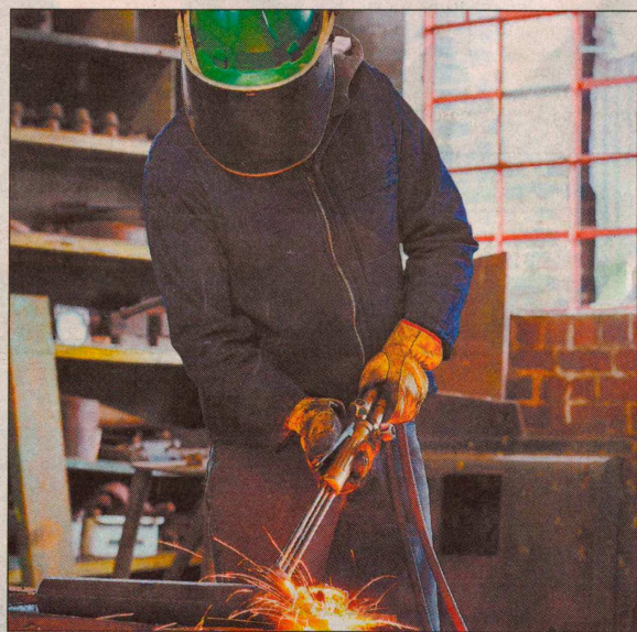
HARD AT WORK. A Reefsteamers volunteer works in the workshop at their depot in Germiston in preparation for the open day.