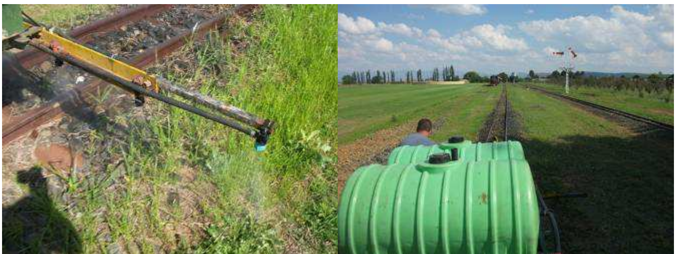
Below: The weed Trolley in action.