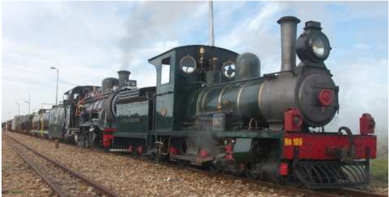
Below left: Henk doing the last work on the axle box keeps.

The Lawley tender was shunted out this morning and the wheels will now be fitted back and the loco and tender will be connected again.