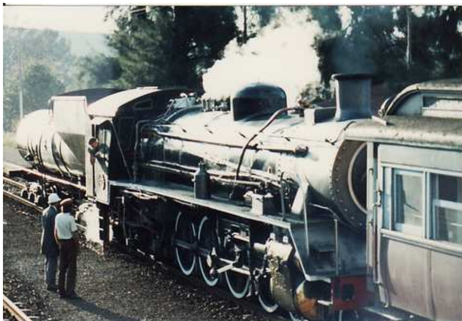
Below: Class 19D number 2742