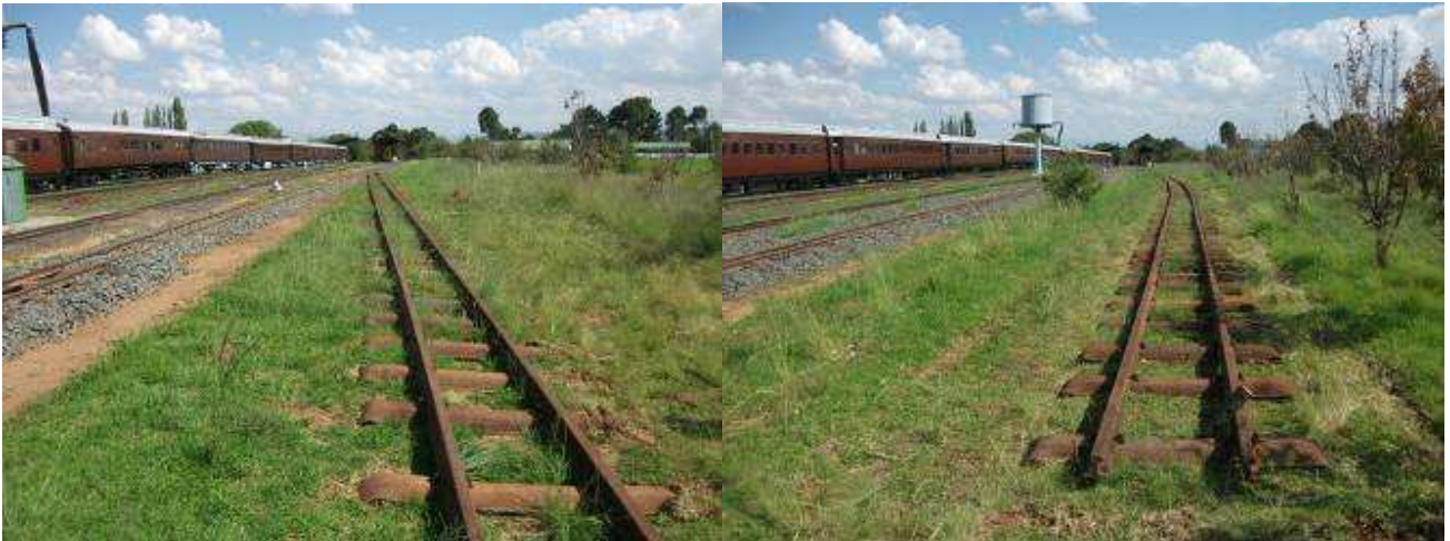
Below: Spraying weeds in Hoekfontein Station.