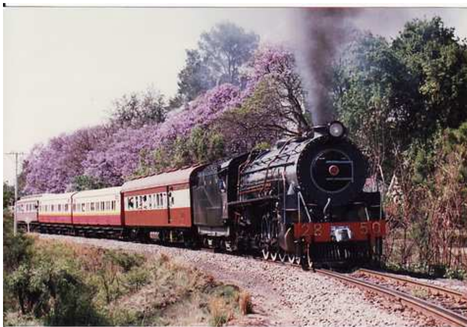
Below: Class 25NC number 3407.