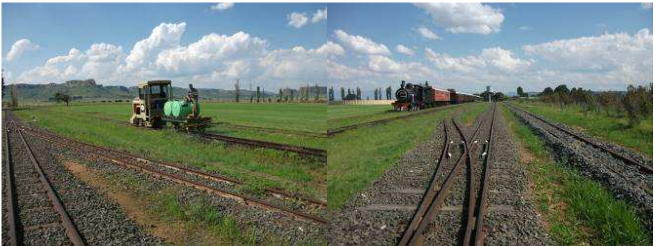
Below left: The effective weed sprayers.