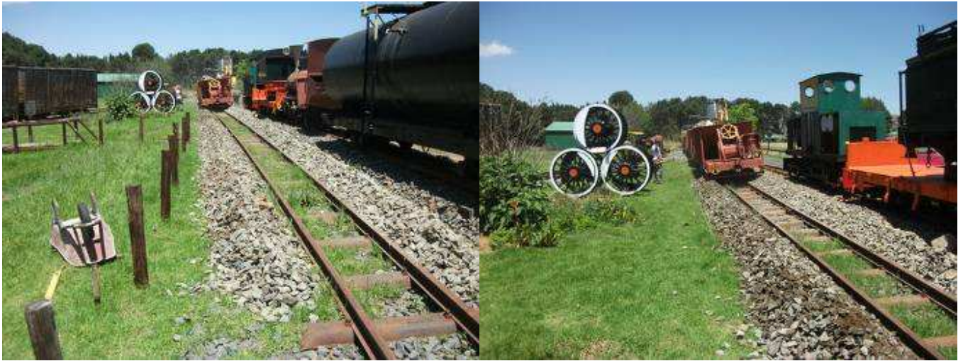
Below: Derrick controlling the ballast process.