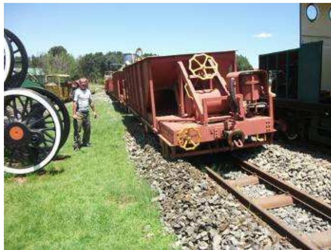
The next was to lift pack and level the line.