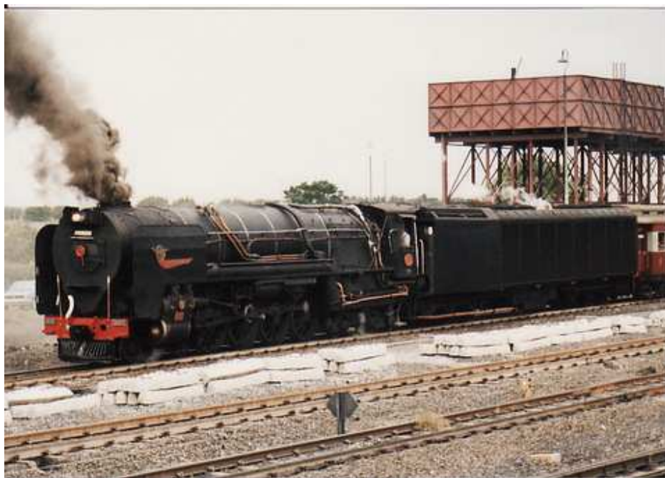
Below: Class 24 number 3632.