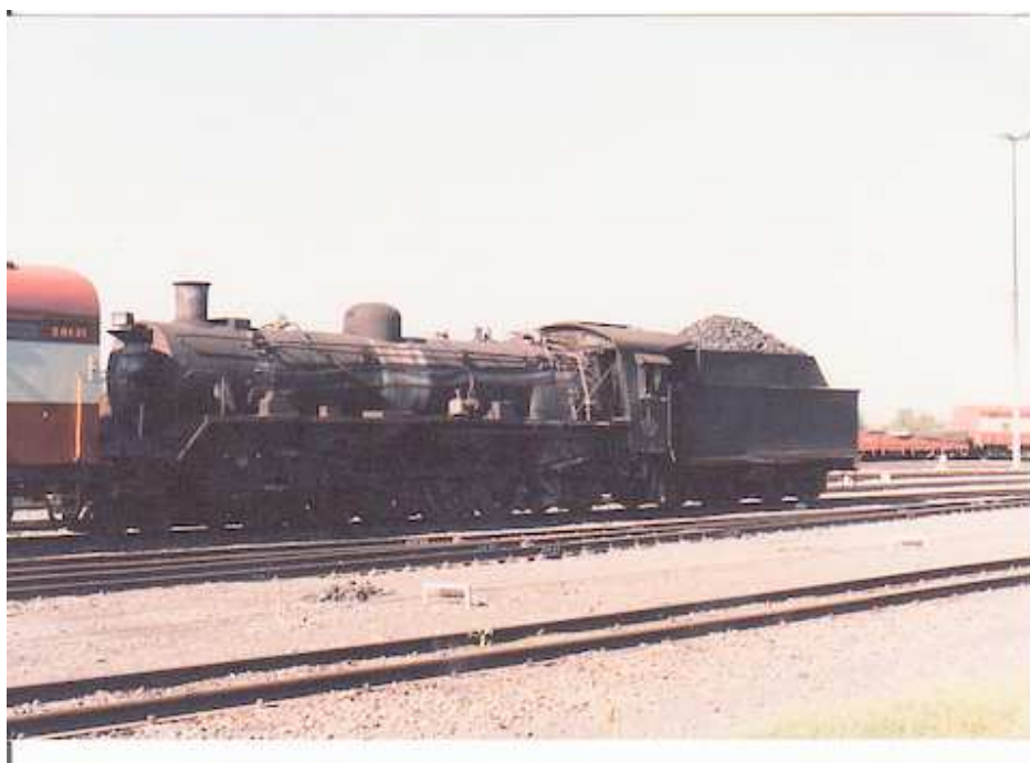
Below: Class 15CA number 2850.