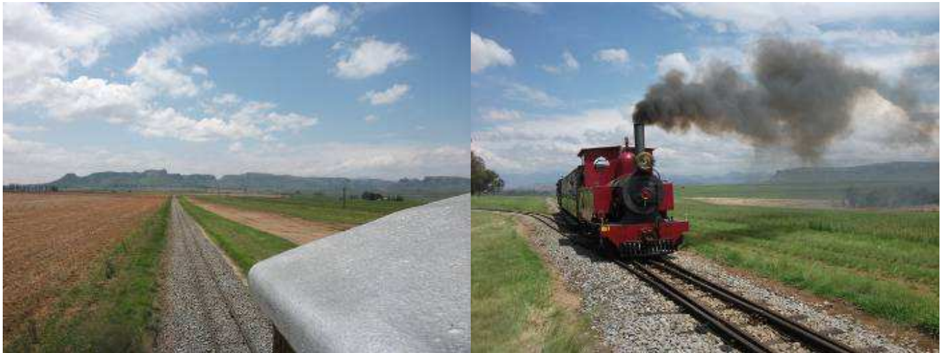
Below left: The Barclay nearing the Intermediate home signal towards Hoekfontein Station on the return trip.