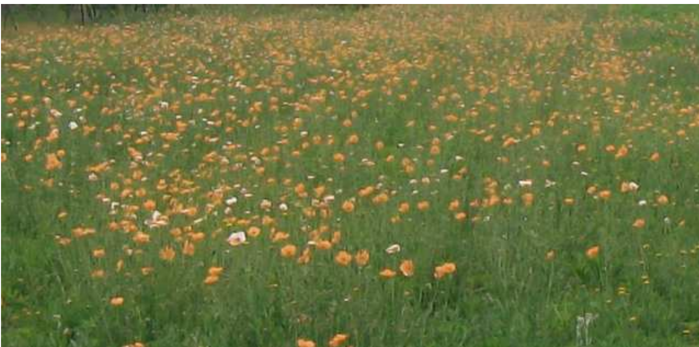
Below left: A view back.