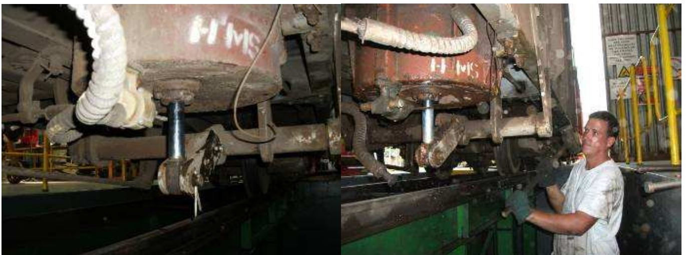
Below right: &^%%$$ the brake axle stuck– This is bad news.