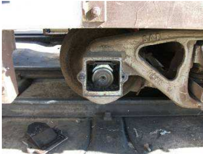
Below left: Loosening and oiling the hand brakes.