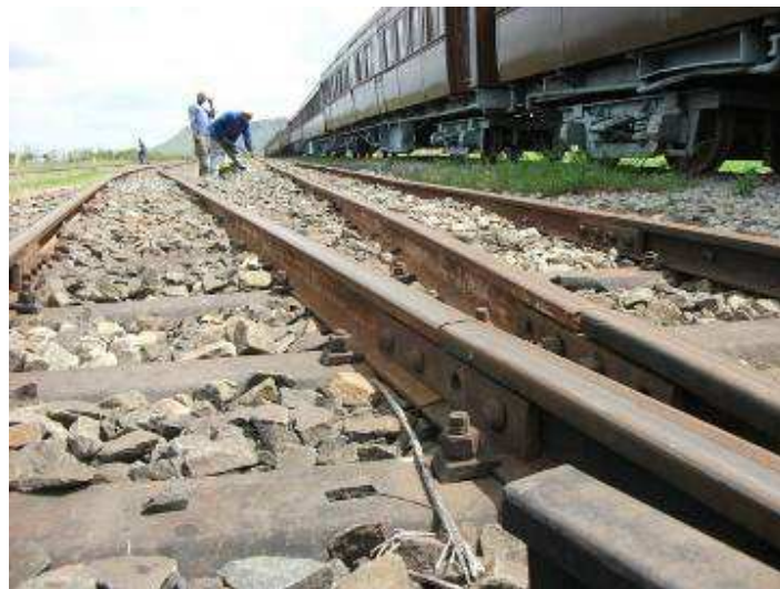
Below: Note the slacks.