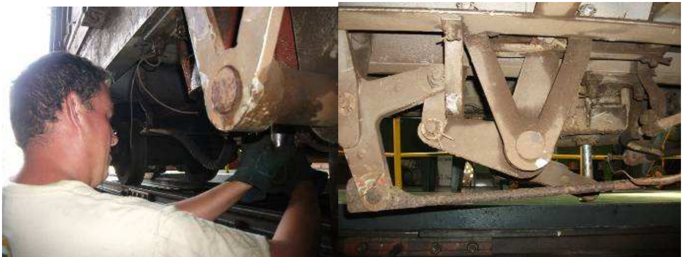
Below: All these wagon bearings were fitted in and the boxes packed with new soaked axle box wool.

The brakes were adjusted and a vacuum brake test was done on 2 of the wagons, the other 2 still needs overhauled vacuum cylinders.