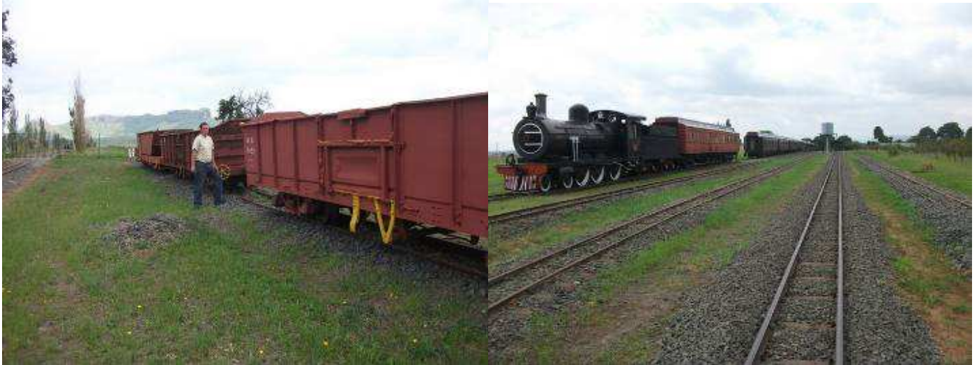
Below: We took our casualties and quickly tackled the slacks in the Hoekfontein yard.