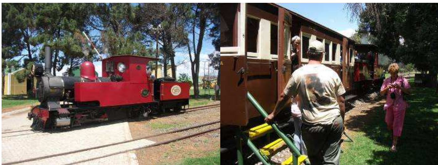
Below left: The Train departed just after 13H00 and is seen here passing the intermediate home signal on her way to Grootdraai.