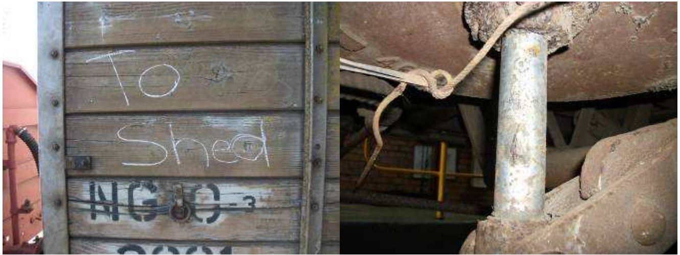
Below left: Wouter removing the old piston rod and replaced with a new one.