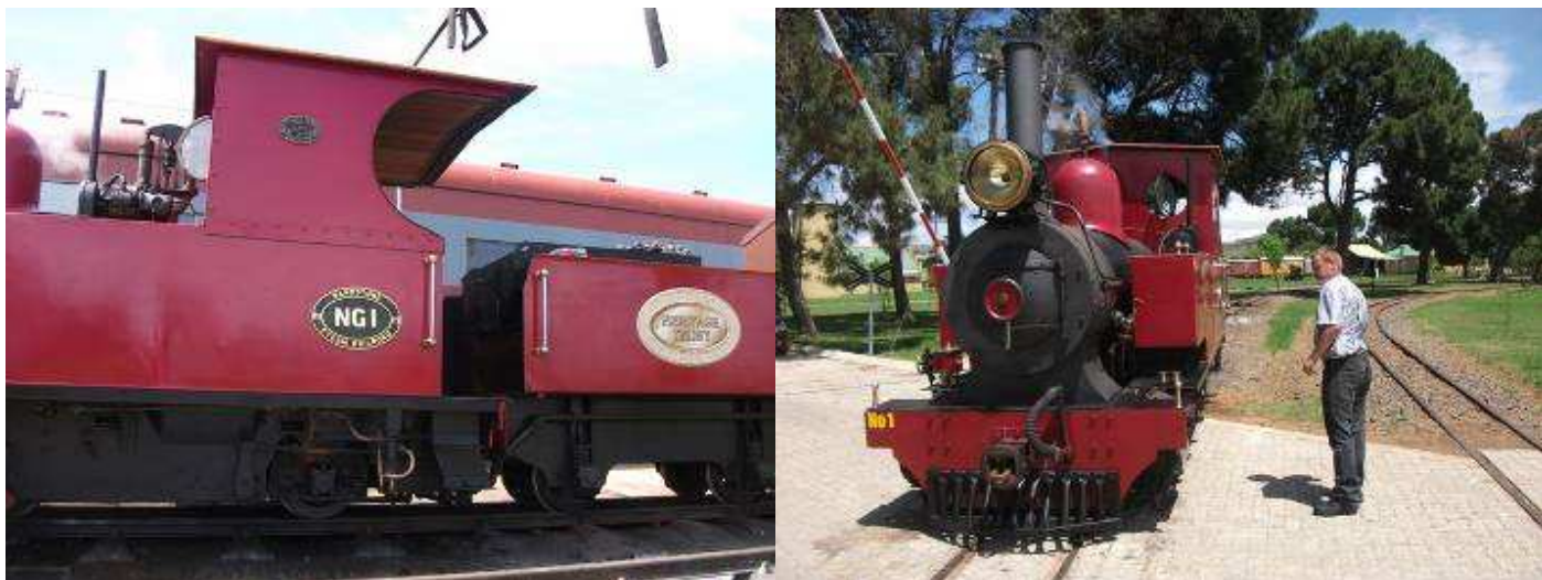
Below left: A pretty sexy Little loco.