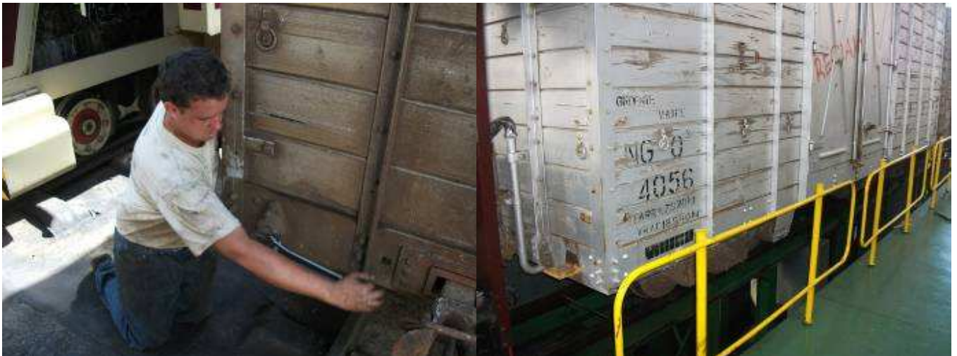
Below left: A new plastic release valve was fitted and all the brake gear pins were greased.