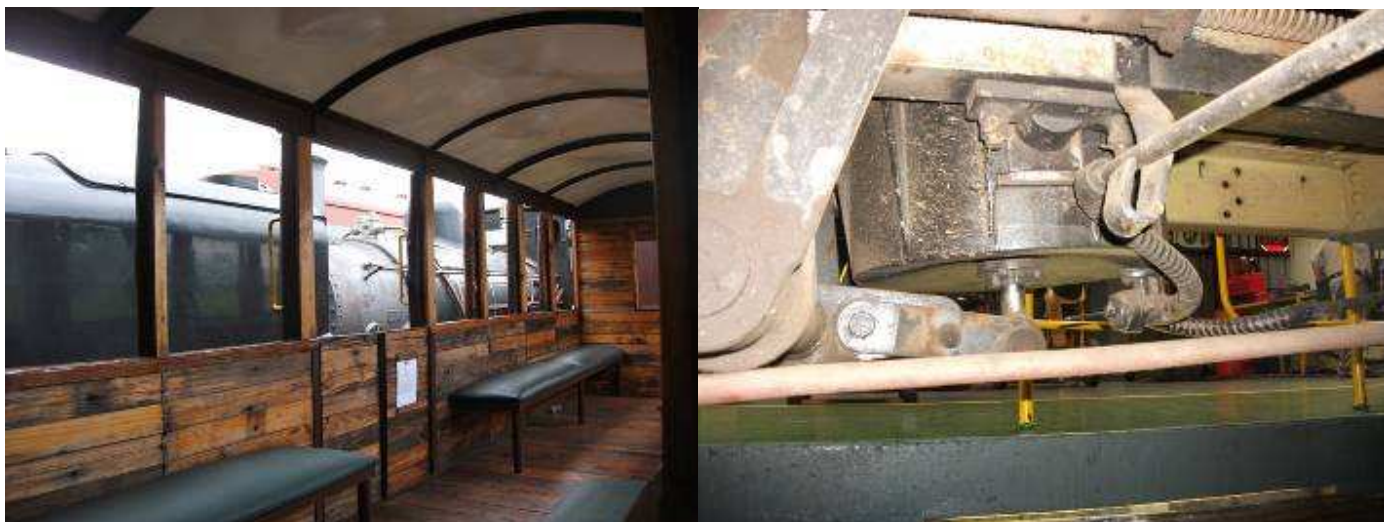
Below left: The Saloon and PE coaches on the way to the pit.