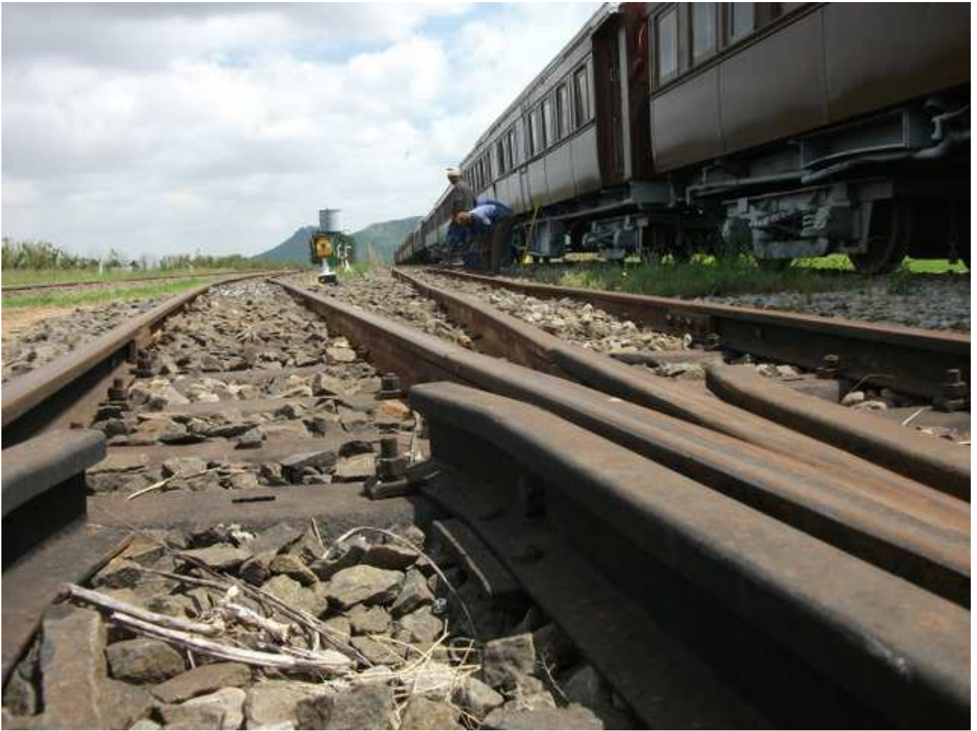
Below right: Neat and straight again.