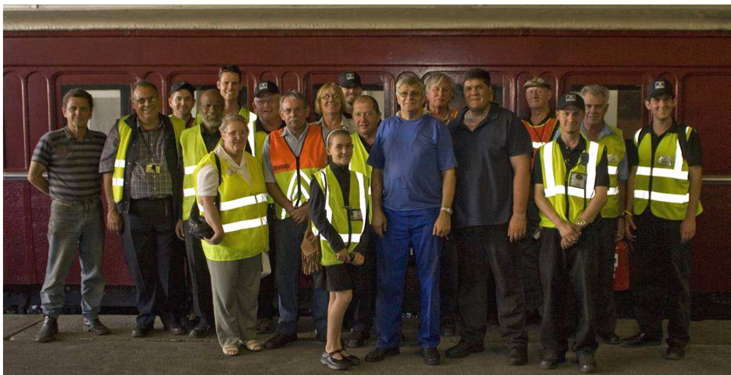
The heroes of the first weekend! Without this team and their hard work, nothing would've been possible.