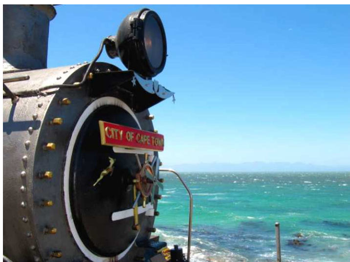
WE DIT IT! The City of Cape Town finally made it to the Indian Ocean! Pictured here at Glencairn station.