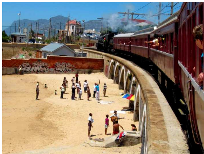
Oral langs die pad het ons mense in verwondering gelaat. Hiërdie mense het definitief nie beplan om dié dag 'n stoomtrein te sien nie.