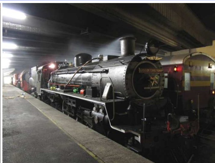
Almost two hours later there's at least some smoke coming out of the chimney.