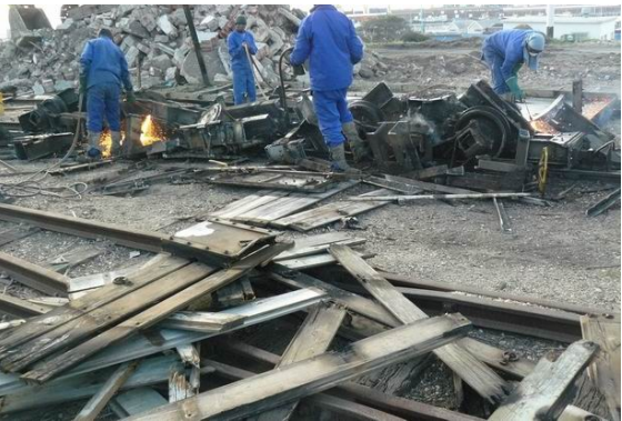
These two pictures show the death of wooden fruit wagon number 2837.