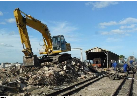
The carpenter's shop is no more.