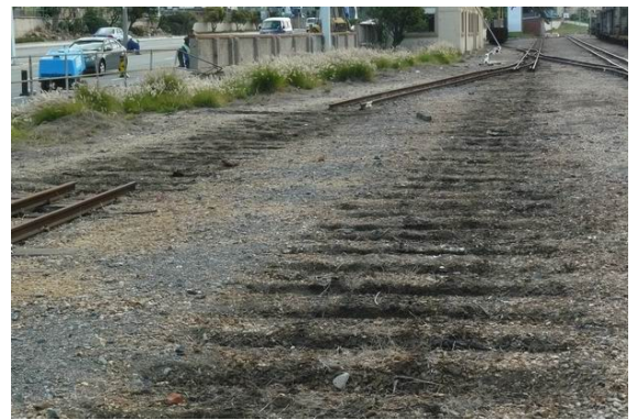
Tracks have also been lifted. It is not known what has happened to all the freight wagons that were parked on these sidings. Presumably carried away as scrap metal.