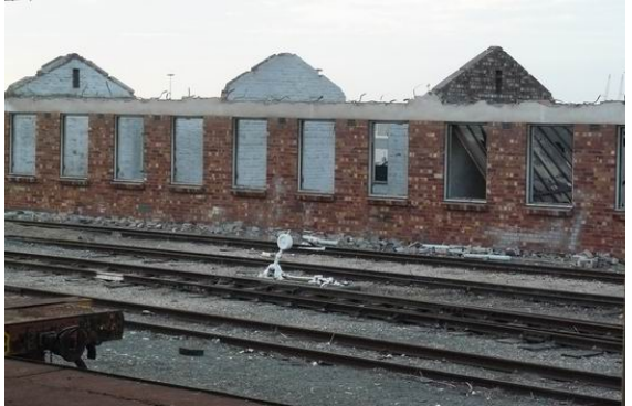
The beginning of the end, of the carpenter's workshop.

The station buildings which the Apple Express Company lease from Transnet have been spared. The two badly vandalised toilet buildings next to the station building have been demolished. As a result, the lack of toilet facilities on the station will now have to be addressed. There is thought of building a single toilet cubicle inside the old ticket office.