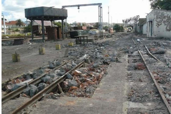
Here the wooden sheds have all gone and the locomotive service pits have been filled in.

As mentioned in the last newsletter, the Humewood Road steam depot has been earmarked for demolition. This is currently underway and is almost complete. Here is a selection of photographs recently taken showing what is happening there.