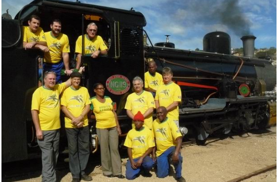
Everyone sporting their yellow football jerseys

The 2010 FIFA World Cup football competition is about to begin and not to be outdone; the staff at the workshop depot and the loco footplate staff decided to don their official yellow South African team jerseys in a show of support for the national side. Maybe with a little bit of steam power behind the South African team, they can achieve something great in the competition.