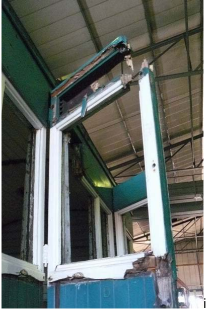
Wood rot on a door of coach no.83.

The restoration of passenger coach no. 83 is progressing slowly. During the strip down, it was found that the woodwork on the coach was in a very sorry state, the result of many years of exposure to the weather.