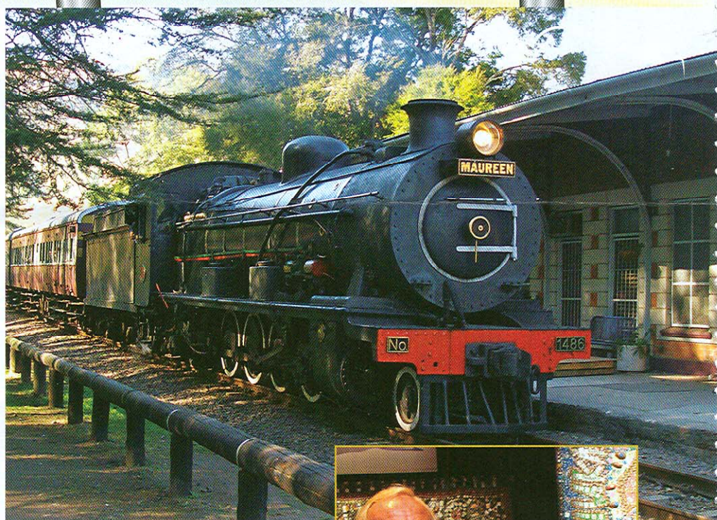
USR Class 3 BR arrives at Inchanga.

The 12th International Time of the Writer Festival offers a mix of literary faces and features, with great debate and discussion around the examination of the writer's place in the context of our global climate. A week of evening panel discussions, book launches,