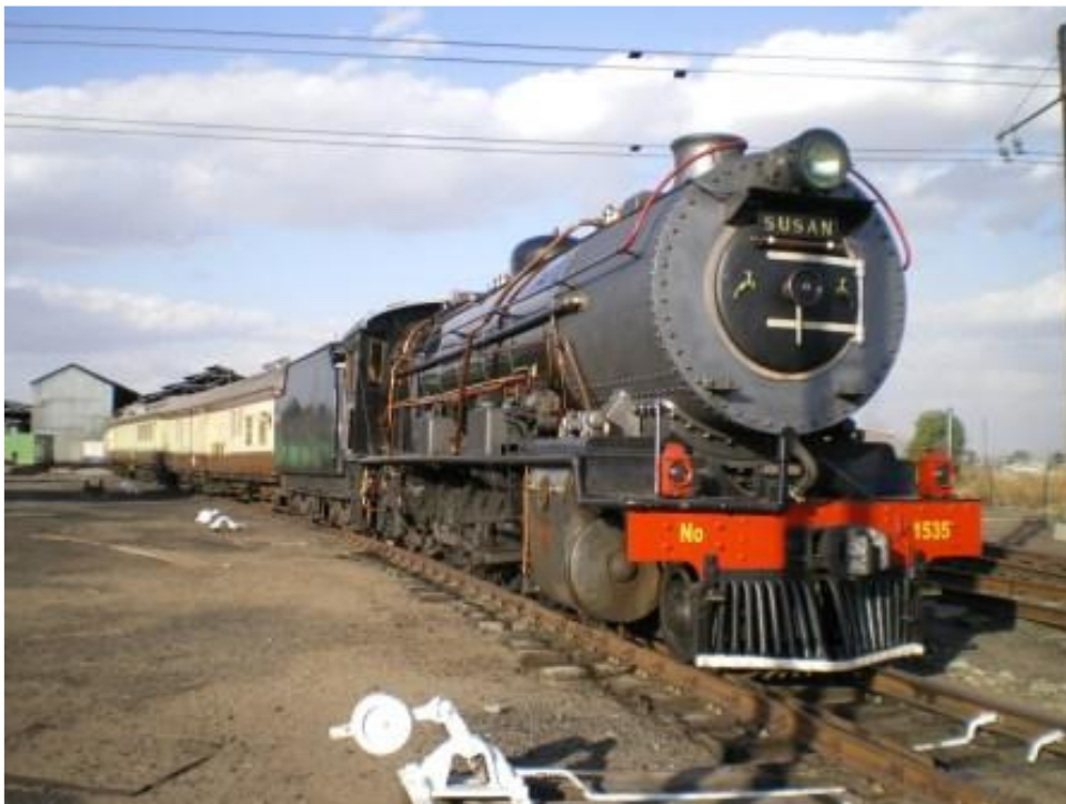
12AR 1535 on Shongololo Duty 19 August 2009