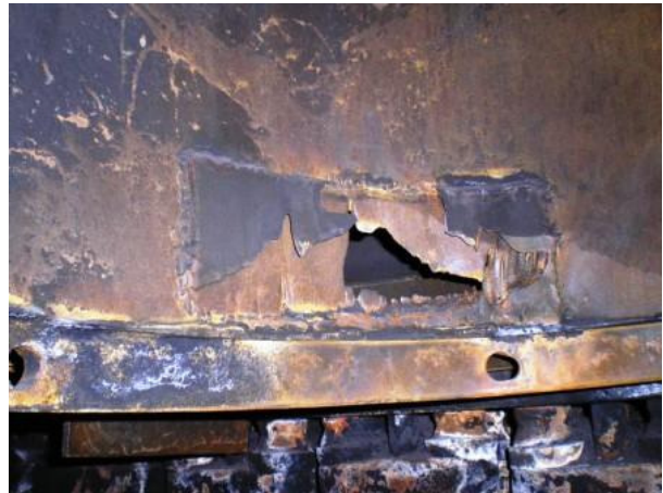
The Holey Chimney of 3472