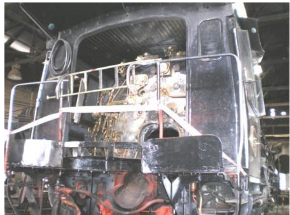
The Cab from Ground Level