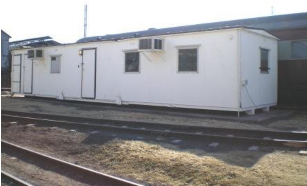
The Donated Office Container in Position