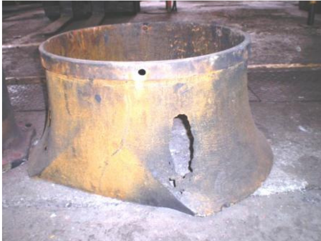
The Holey Petticoat of 3472.

The tender to locomotive cushion needs to be shimmed up to prevent undue sideways strain which could, in the worst case cause a derailment.